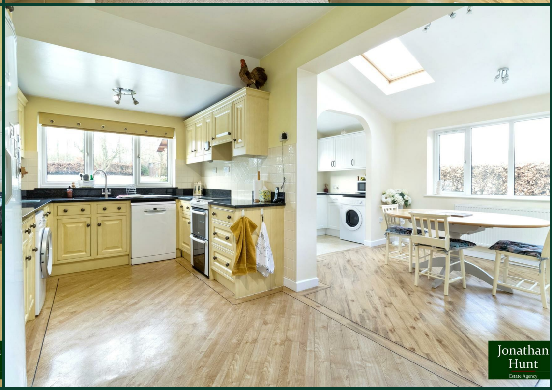
Jonathan Hunt Estate Agency